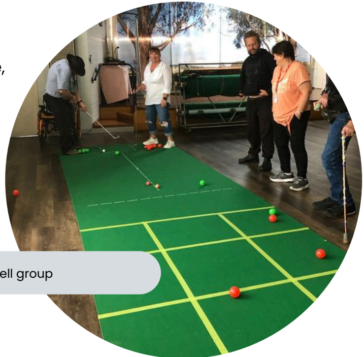
Our Morwell group

This year, our community has embraced life, achieving successes and enjoying their favorite activities.