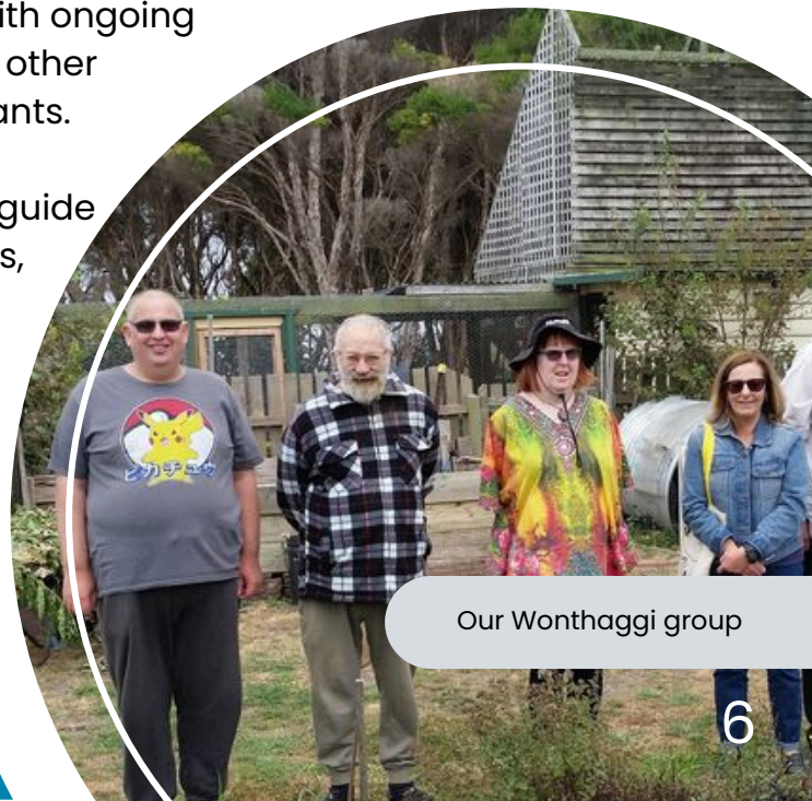
Our Wonthaggi group

Trained Headway Gippsland professionals guide and support our volunteers within their roles, ensuring consistency and a high quality of support provided to participants.