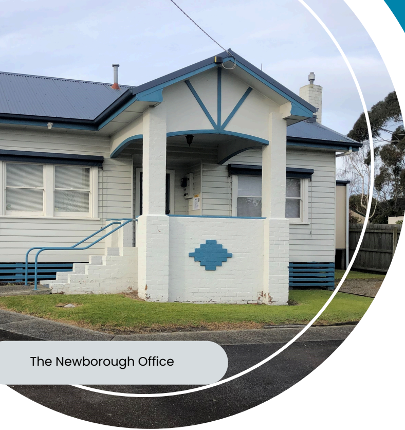
The Newborough Office