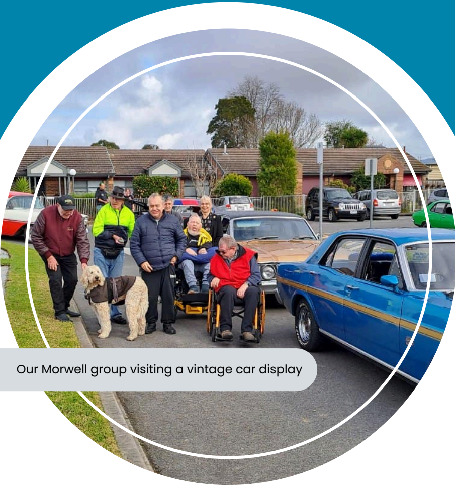
Our Morwell group visiting a vintage car display